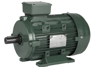
WorldWide Electric IEC Frame Motor IEC3-18-100