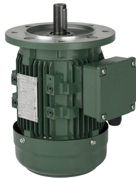
WorldWide Electric IEC Frame Motor with FF Flange IEC1.5-18-90 and IEC90-FF