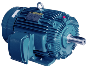
LAM Series T - Frame Motor Available in 1 - 500 hp Ratings IEEE 45 Rated