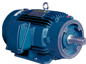
LAM Series C-Face Motor Available in 1 - 200 hp Ratings IEEE 45 Rated